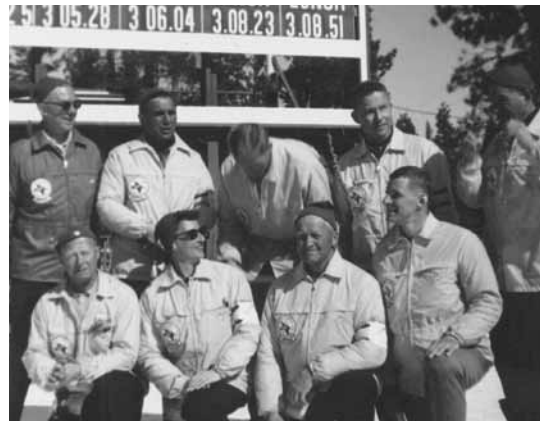
1960 Winter Olympic, cross-country course staff