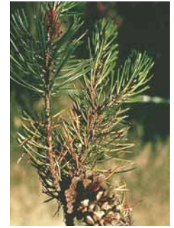
Sugar pine (Pinus lambertiana)

The restrooms and park office are accessible. If you need assistance, please call (530) 525-9528 or (530) 525-7232.