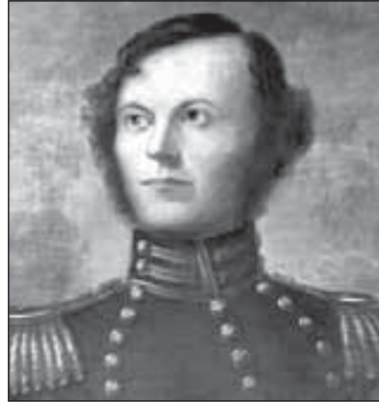
Col. James Walker Fannin

Under the command of Colonel James Walker Fannin Jr., this army began to fortify Presidio La Bahia (which Fannin renamed Fort Defiance) from possible Mexican attack.